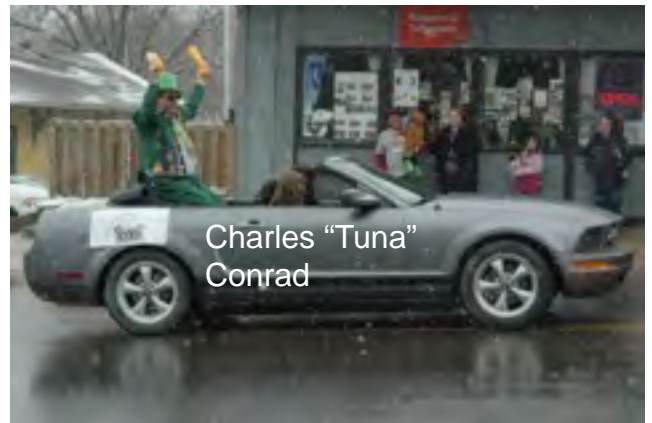
Charles "Tuna" Conrad