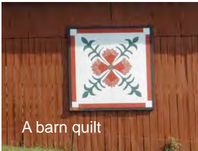
A barn quilt

Barn Quilt Class 101 will be held at our site in the barn on Saturday, October 26th at 10:00 A.M. to 2:00 P. M. Class fee is $35.00 and includes all supplies needed to complete the block.