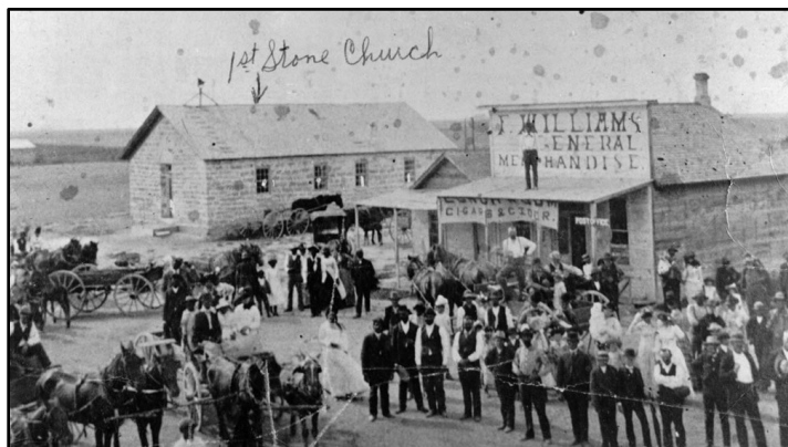
Williams General Store and the first stone church in the town

This program will focus on the unique experience of mothers and their children in Nicodemus, some of whom were the first members of their families to be born free. The presentation will explore the dynamics of mothers and their children, and the contrast of life and decisions based on the concept of “choice,” which freedom now allowed.